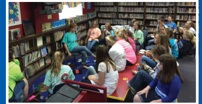
leading by example