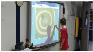
smart boards for class