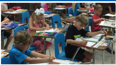
first grade reading

Preparing Students Spiritually, Academically, and Athletically for over 40 years.