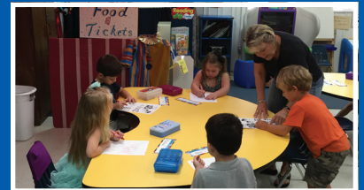
learning is fun